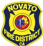
Novato Fire District