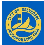
City of Belvedere