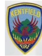
Kentfield Fire Protection District