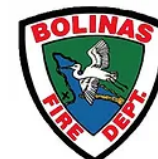
Bolinas Fire Protection District